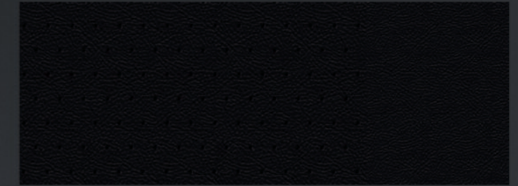
Black Claudia full leather trim on Allure level.