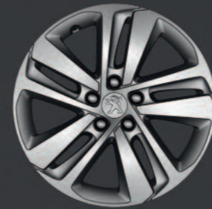
17" Phoenix Alloy Wheels