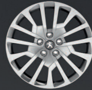
17" Miami Wheel Trims