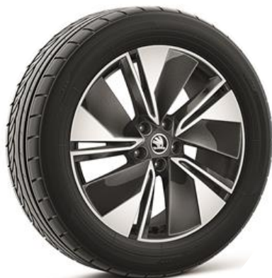
19" 'Regulus' alloy wheels (Code PJA / PJB)