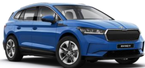
Energy Blue (K4K4 – Solid)