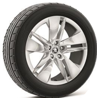
19" 'Proteus' alloy wheels (Code U60)