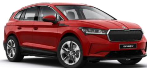
Velvet Red (K1K1 – Exclusive)