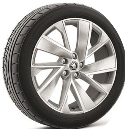
20" 'Vega' alloy wheels (Code PCA / PCD)