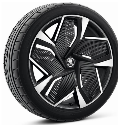
21" 'Vision' anthracite alloy wheels (Code PJS)