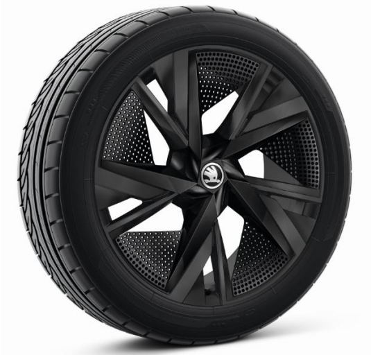
20" 'Taurus' black metallic alloy wheels (Code 55K)