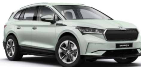
Artic Silver (H6H6 – Metallic)