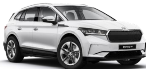
Moon White (2Y2Y – Metallic)