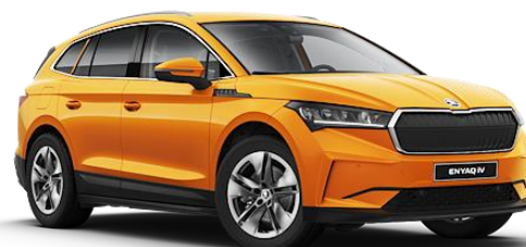
Phoenix Orange (2X2X – Exclusive)