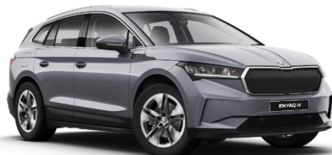
Graphite Grey (5X5X – Metallic)