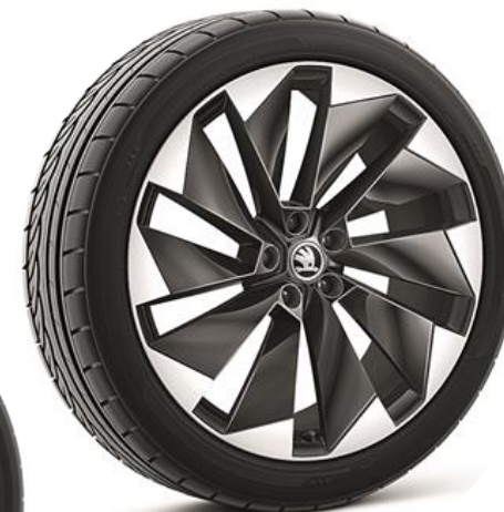
21" 'Supernova' alloy wheels (Code PJF / PJL)