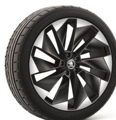
21" 'Supernova' black alloy wheels (Code PJT / PJU)