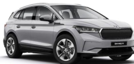
Brilliant Silver (8E8E – Metallic)