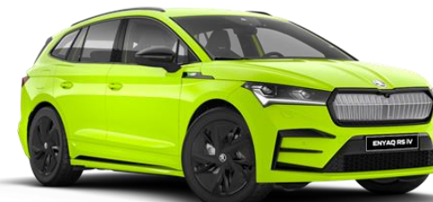
*Mamba Green (I3I3 – Solid)