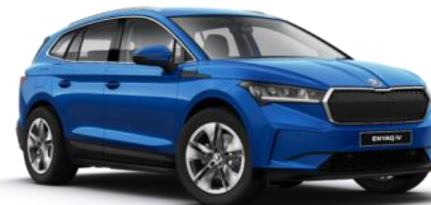
Race Blue (8X8X – Metallic)