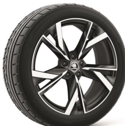
20" 'Taurus' anthracite alloy wheels (Code PJD / PJI)