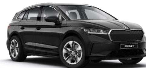
Black Magic (1Z1Z – Metallic)