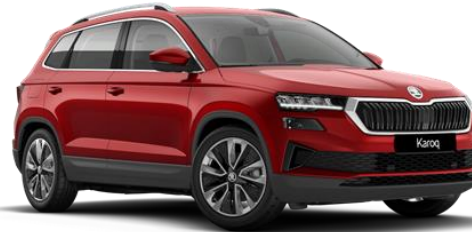
Velvet Red (K1K1 – Exclusive)