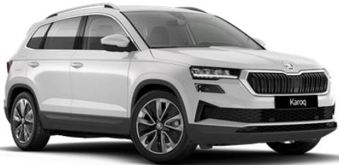
Moon White (2Y2Y – Metallic)