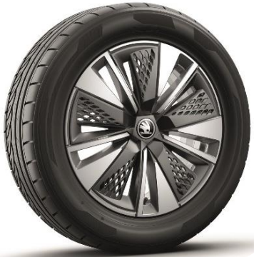
17" Scutus Silver incl. black matt aero inserts (Code U47)