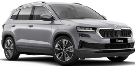
Brilliant Silver (8E8E – Metallic)