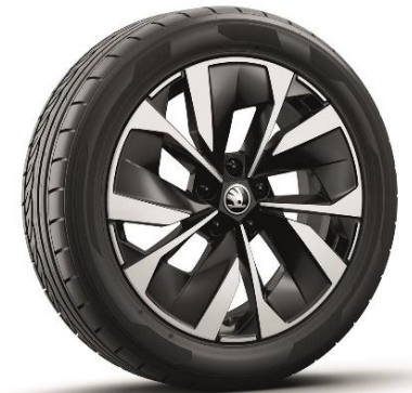
18" Miran Black aero alloy (Code PV3)