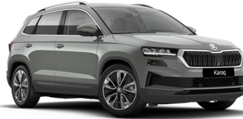
Steel Grey (M3M3 – Solid)