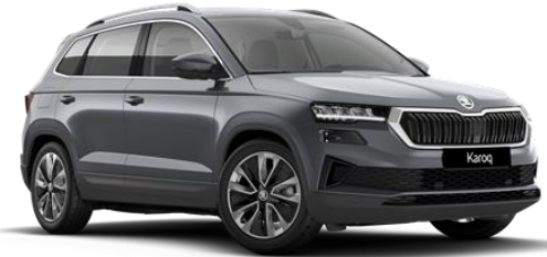
Graphite Grey (5X5X – Metallic)