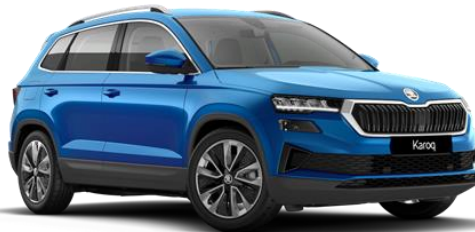
Race Blue (8X8X – Metallic)