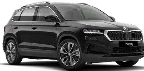
Black Magic (1Z1Z – Metallic)