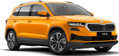
Phoenix Orange (2X2X – Exclusive)