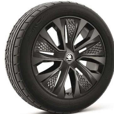
18" Procyon Black incl. black aero inserts (Code C3I)